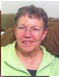
Pre-op (inset), January 2013/Post Op (April, 2013) - doesn't she look great?